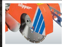
Front Blade Mount