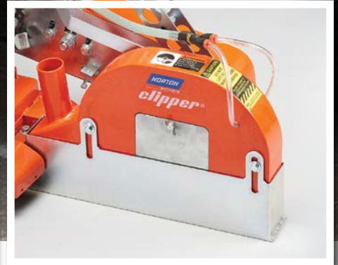
Vacuum Attachment System