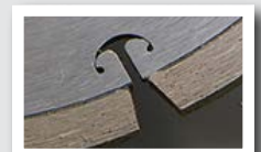
Anchor Slot Gullets